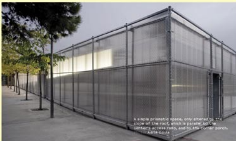
A simple prismatic space, only altered by the slope of the roof, which is parallel to the center's access ramp, and by the corner porch.

Location Barberà del Vallès Programme Public school's gymnasium Year 2007 (project) 2008 (construction) Area 453 m 2