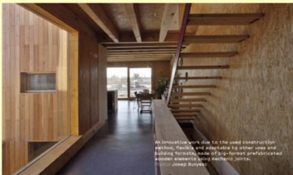
An innovative work due to the used construction method, flexible and adaptable to other uses and building formats, made of big-format prefabricated wooden elements using mechanic joints.

Location Lleida Programme Private house Year 2009